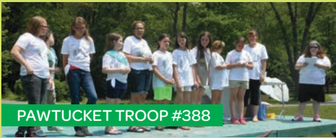
PAWTUCKET TROOP #388