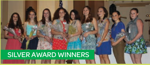
SILVER AWARD WINNERS