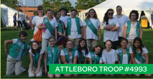
ATTLEBORO TROOP #4993