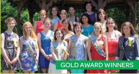
GOLD AWARD WINNERS