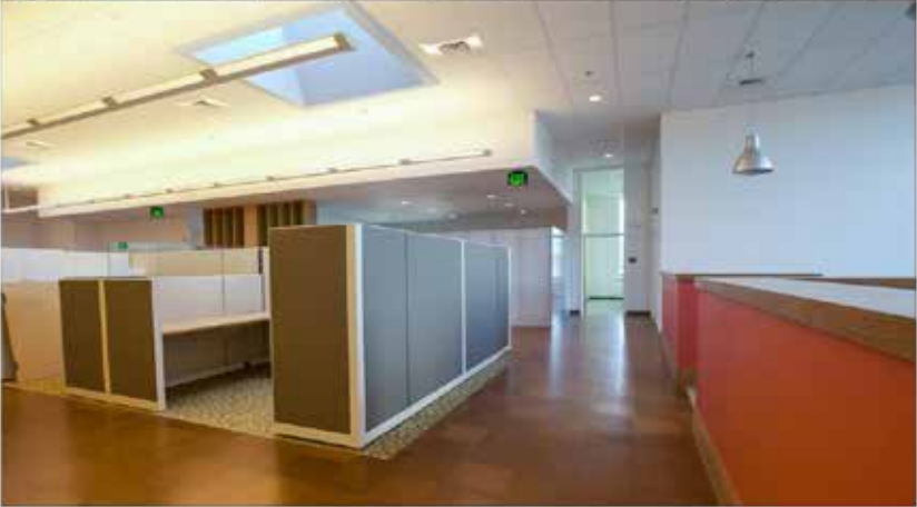
Girl Scouts of RI Corporate Headquarters, Warwick, RI